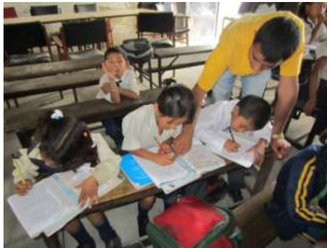
School in Kathmandu, August 2015